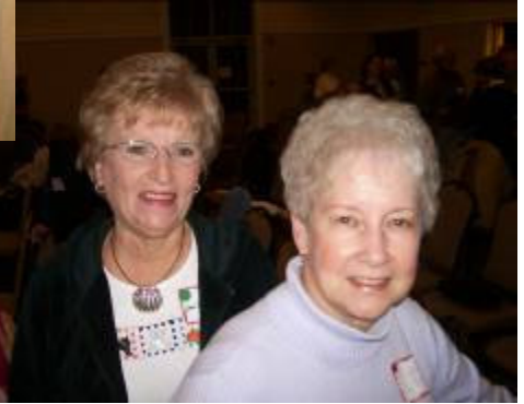
Always time to cheese it up