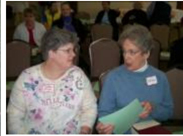
Some of us do go to classes