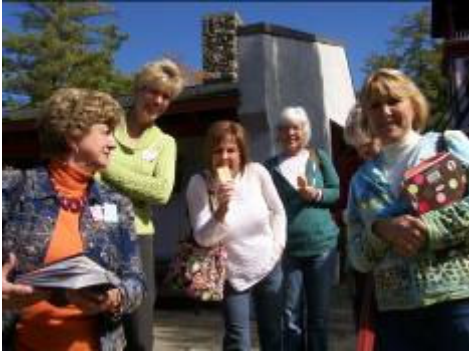
Ice Cream is a treat after lunch