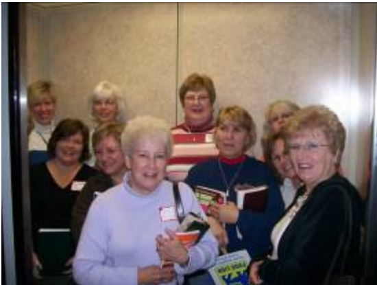
How many New Sterling women can you fit in an Elevator?