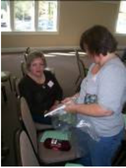
Still time to talk crochet