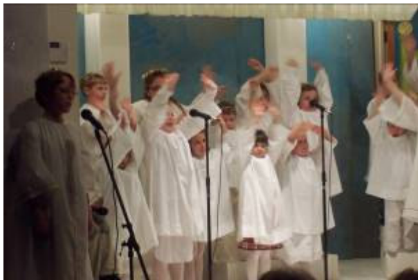
The Children's Choir recently performed their Christmas pro- gram "Angels Aware!"