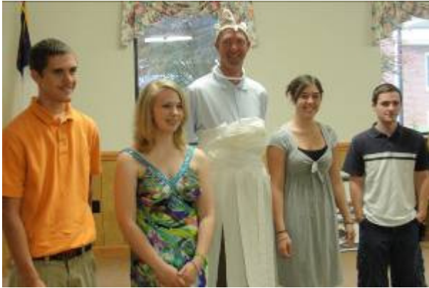
The fashion designers with their amazing gown creations and their nominees.....